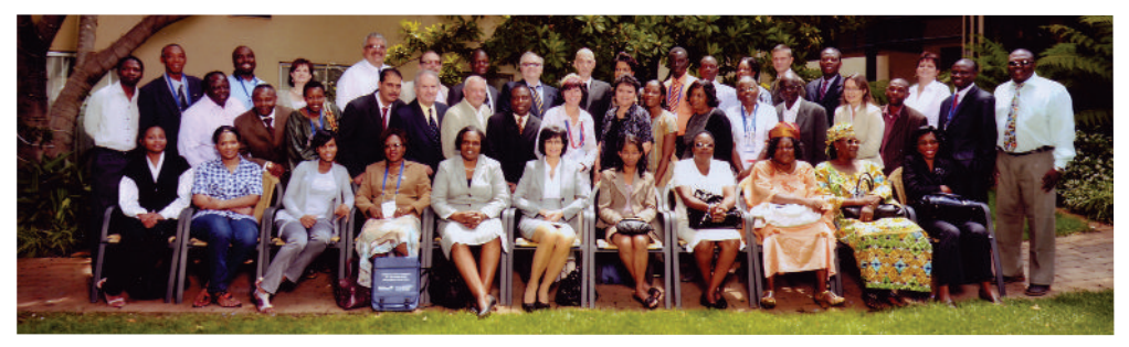
Delegates and Speakers attending the UPU conference